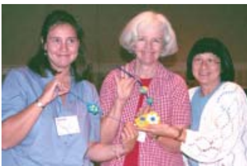
Pediatric Nurse Participants