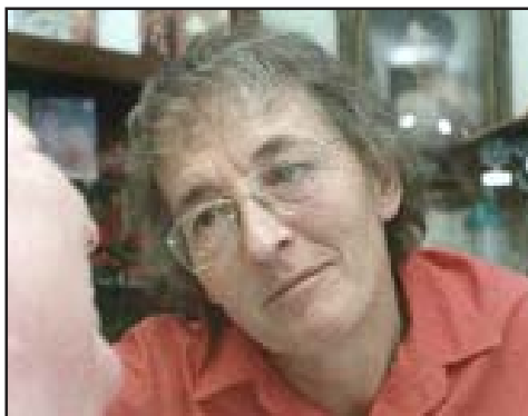
Elisabeth Kubler-Ross/Facing Death