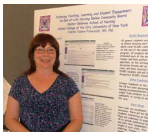
Vidette Todaro-Franceschi Hunter College, NYC EOL Education Via Online Community B'Board