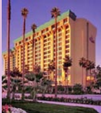
Paradise Pier Hotel

On August 2-4, 2006, pediatric nurses from across the country will gather in Anaheim, CA at the California Paradise Pier Hotel in Disneyland to review the ELNEC-PPC training program. To date, 280 pediatric nurses from 44 states plus the District of Columbia have attended ELNEC-PPC.