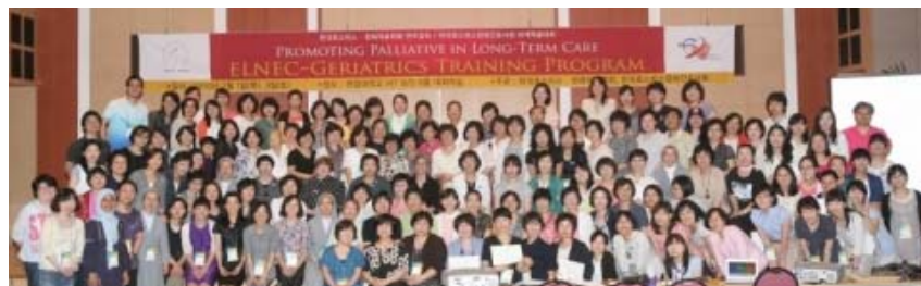
A portion of the over 200 participants in the first ELNEC-Geriatric Course held in Seoul, South Korea in July 2010.